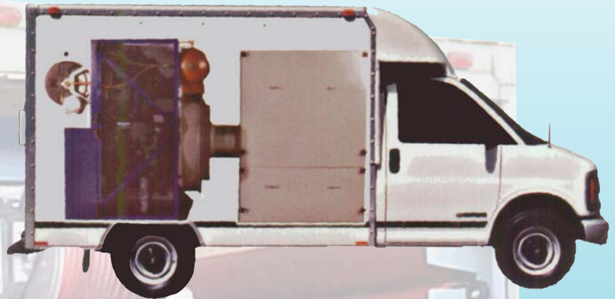
Truck Air Duct Cleaning Setup

2 Stage Filter Box Assembly 13 Cubic Foot Dust Collection Box w/ Trays 4 Bag Filters V Bank w/ Dual 36” x 24” Pleated Filters